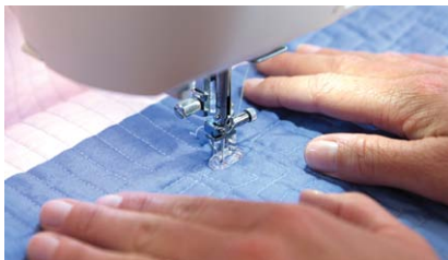
Room to sew, whatever your style.